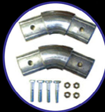
30° & 40° Elbow Kit