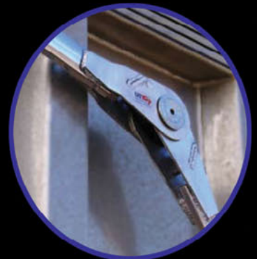
Knuckle Arm for Variable Hts

Life Time Warranty on our Bullet Aluminum Arms