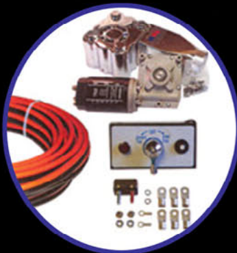
Bullet Proof Slim Motor Kit